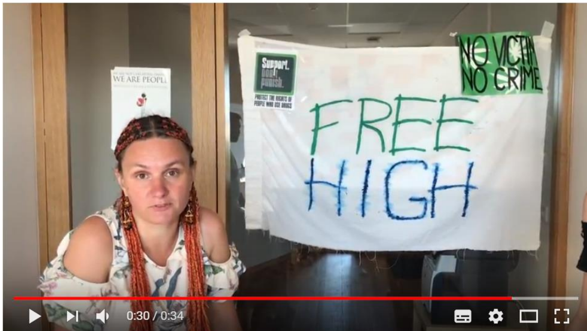
Support. Don't Punish Day. Kazakhstan OST

On June 26, 2018, participants of substitution therapy programs, along with harm reduction organizations in Lithuania , Estonia , the UK , Ukraine , Moldova , Belarus and Russia , held rallies near the embassies of the Republic of Kazakhstan and published photo and video messages calling to save the OST program in Kazakhstan . A community of people who use drugs and people living with HIV in Kazakhstan, our friends and partners held the event in Astana to support the program.