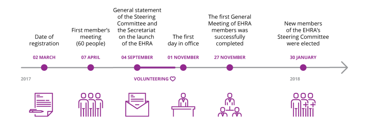
Figure 3. 2017 Timeline.